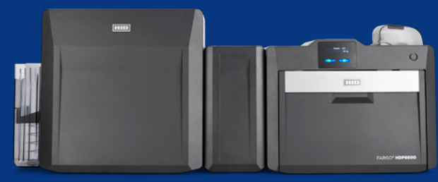
Dual-sided printer/encoder with optional lamination